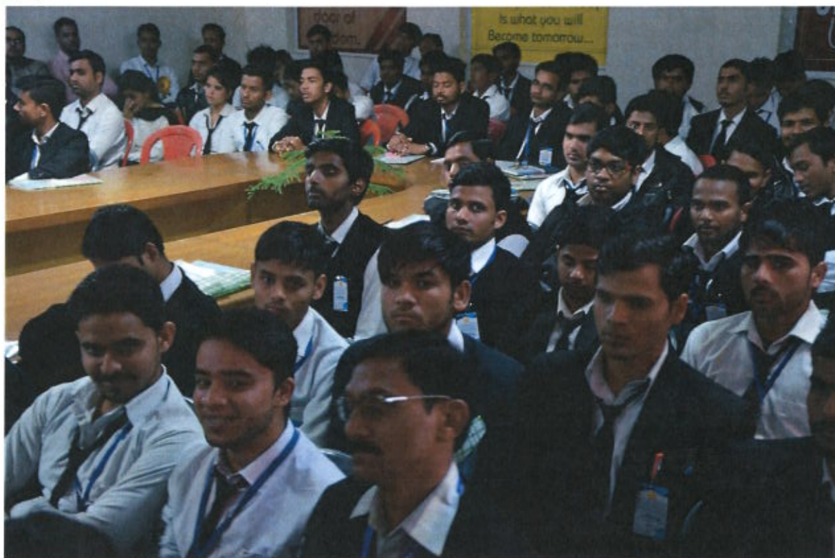
Figure 2: Photograph of faculty members with students attending a seminar on "Innovative Approaches in Research Methodology: Bridging Theory and Practice"

Affiliated To Dr. A.P.J. Abdul Kalam Technical University, Lucknow, U.P. & Approved By PCI